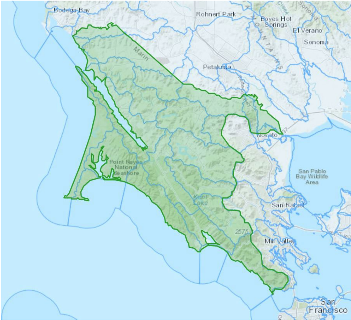
Exhibit A Marin RCD District Map